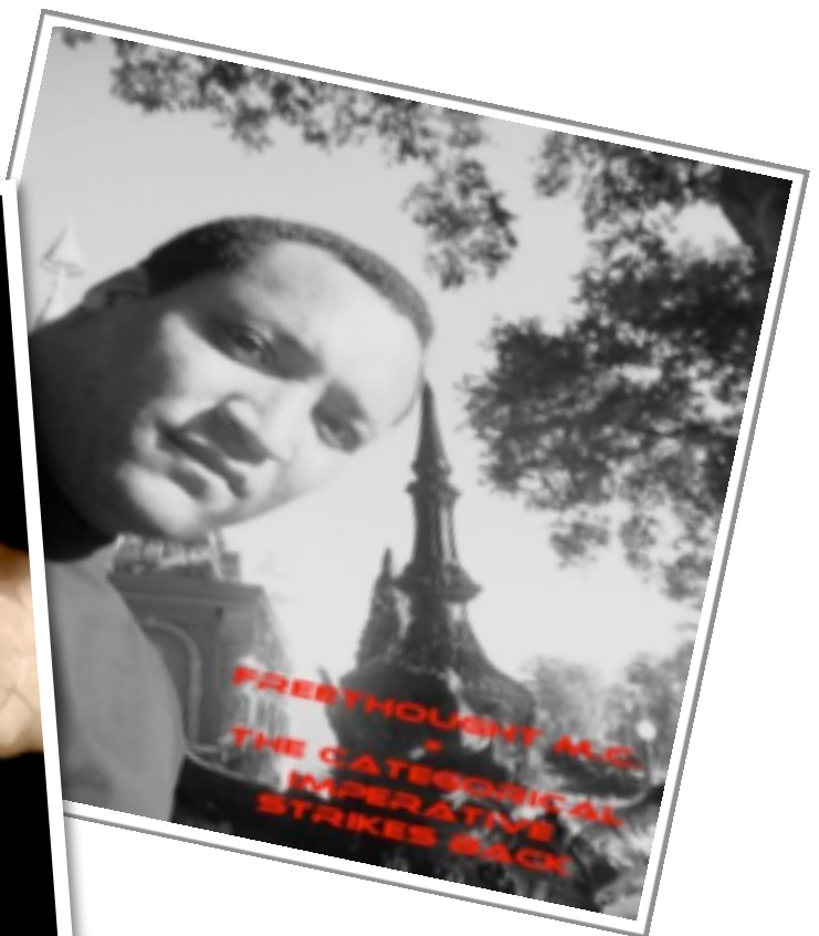
Left: Modern Humanology . Right: The Categorical Imperative Strikes Back .