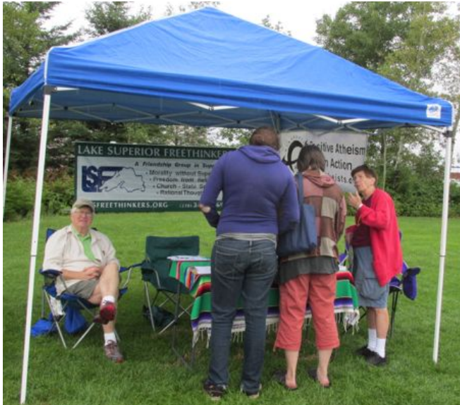
A glimpse of Minnesota Atheists supporting Duluth and Minneapolis Pride this summer.

The law states that "local boards of education may not prohibit school personnel from participating in religious activities on school grounds that are initiated by students at reasonable times before or after the instructional day so long as such activities are voluntary for all parties and do not conflict with the responsibilities or assignments of such personnel." However, teachers still exert authority over students regardless of when an activity takes place. Teachers will still be seen by the children as authority figures, and therefore as the representatives of government. Teachers participating in group prayer will create a religiously coercive environment for the students.